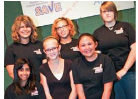
STONYBROOK MIDDLE SCHOOL SAVE CHAPTER AWARD WINNERS.