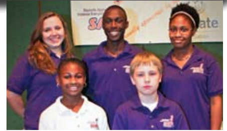
MARION COUNTY S.A.V.E. CHAPTER AWARD WINNERS.