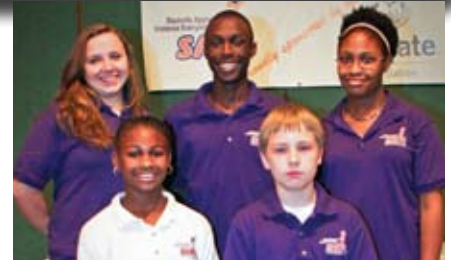
MARION COUNTY S.A.V.E. CHAPTER AWARD WINNERS.