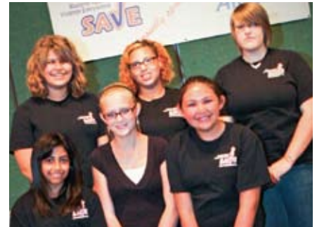
STONYBROOK MIDDLE SCHOOL SAVE CHAPTER AWARD WINNERS.