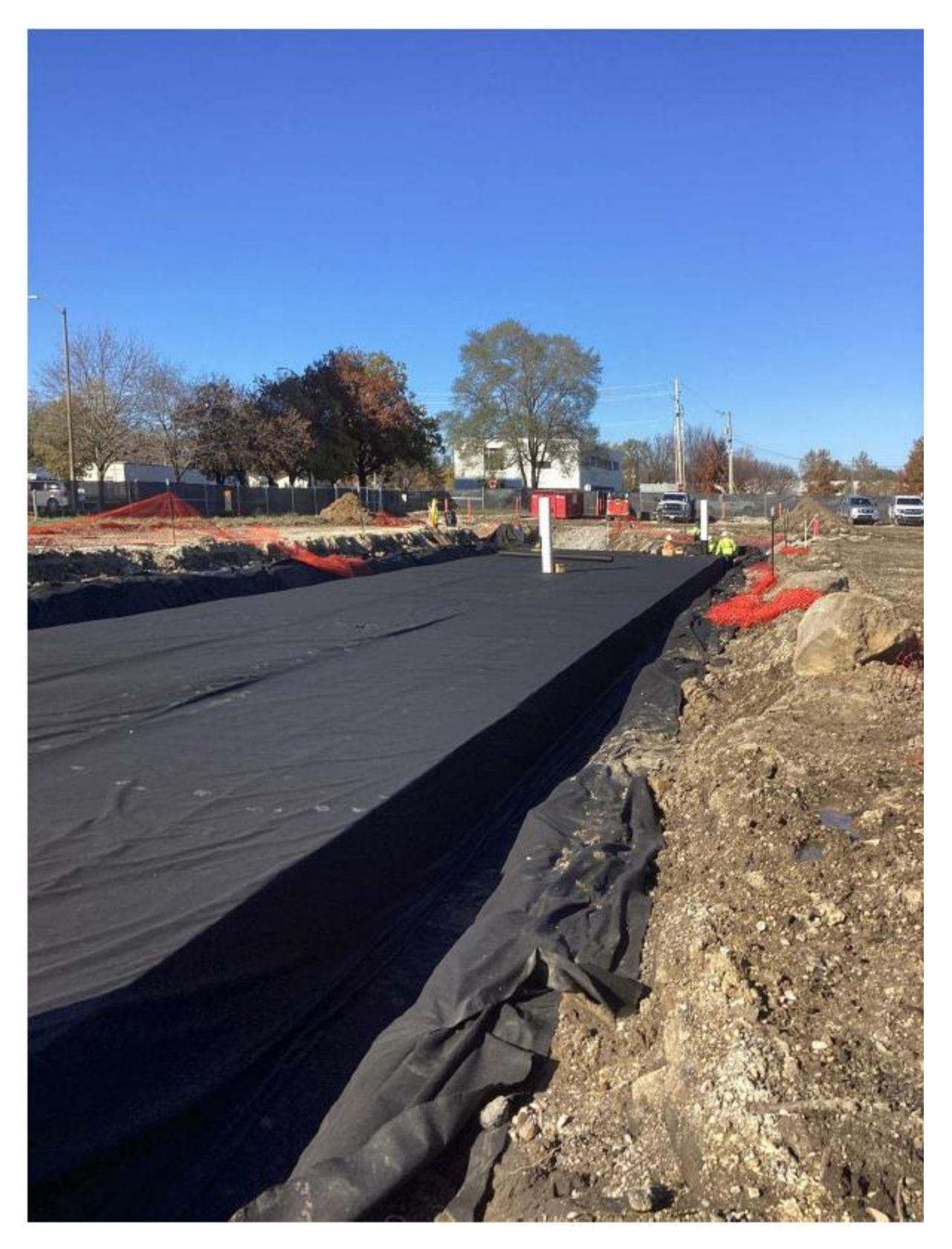
Figure 2: Liner Installation During East R-Tank Construction