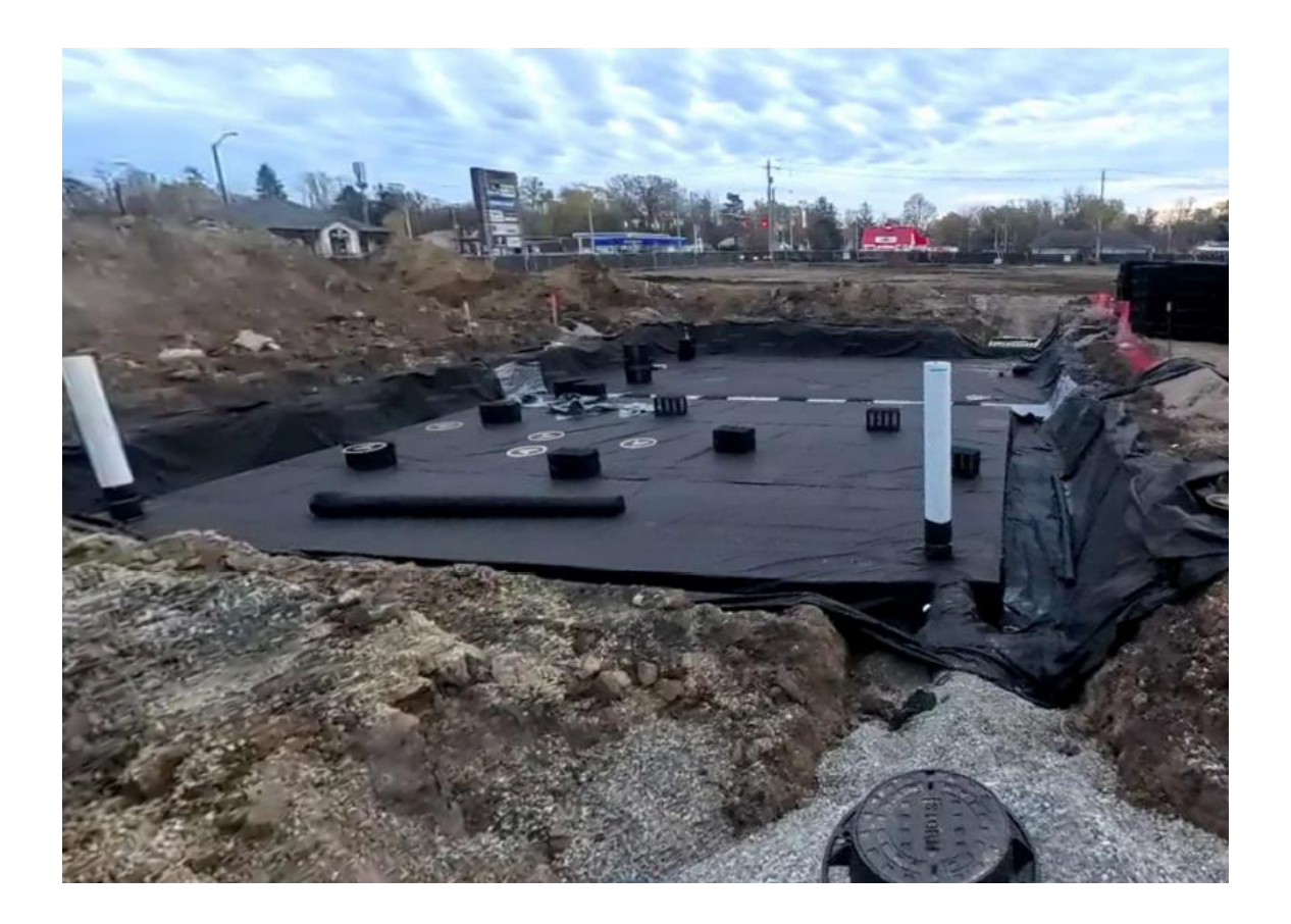
Figure 4: West R-Tank Liner and Crate Installation