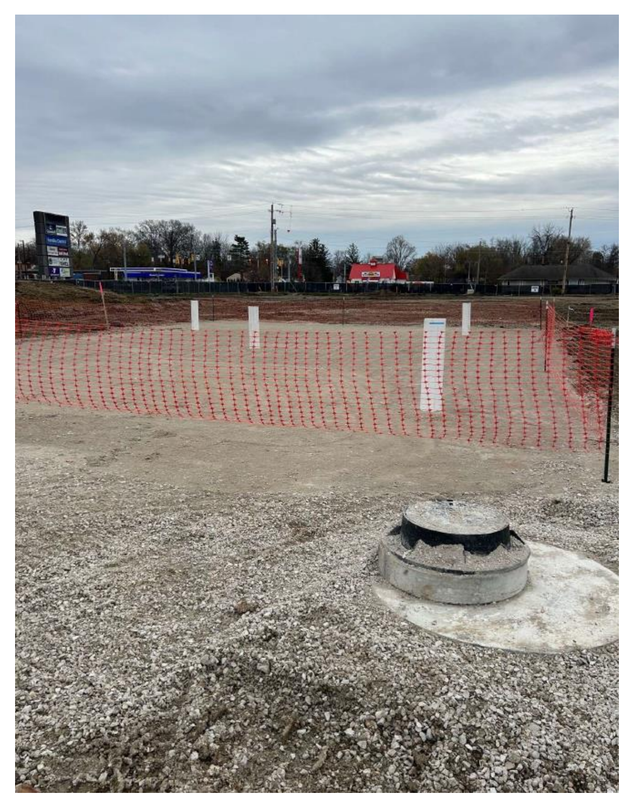
Figure 5: West R-Tank Backfilled, Compacted and Completed