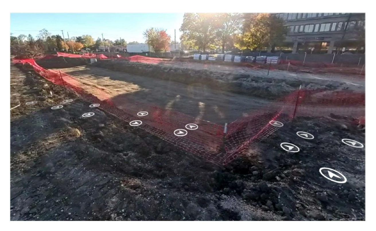
Figure 1: Excavation of East Recession Tank (R-Tank)

Thank you for your continued support, feedback, and commitment to this important development project!