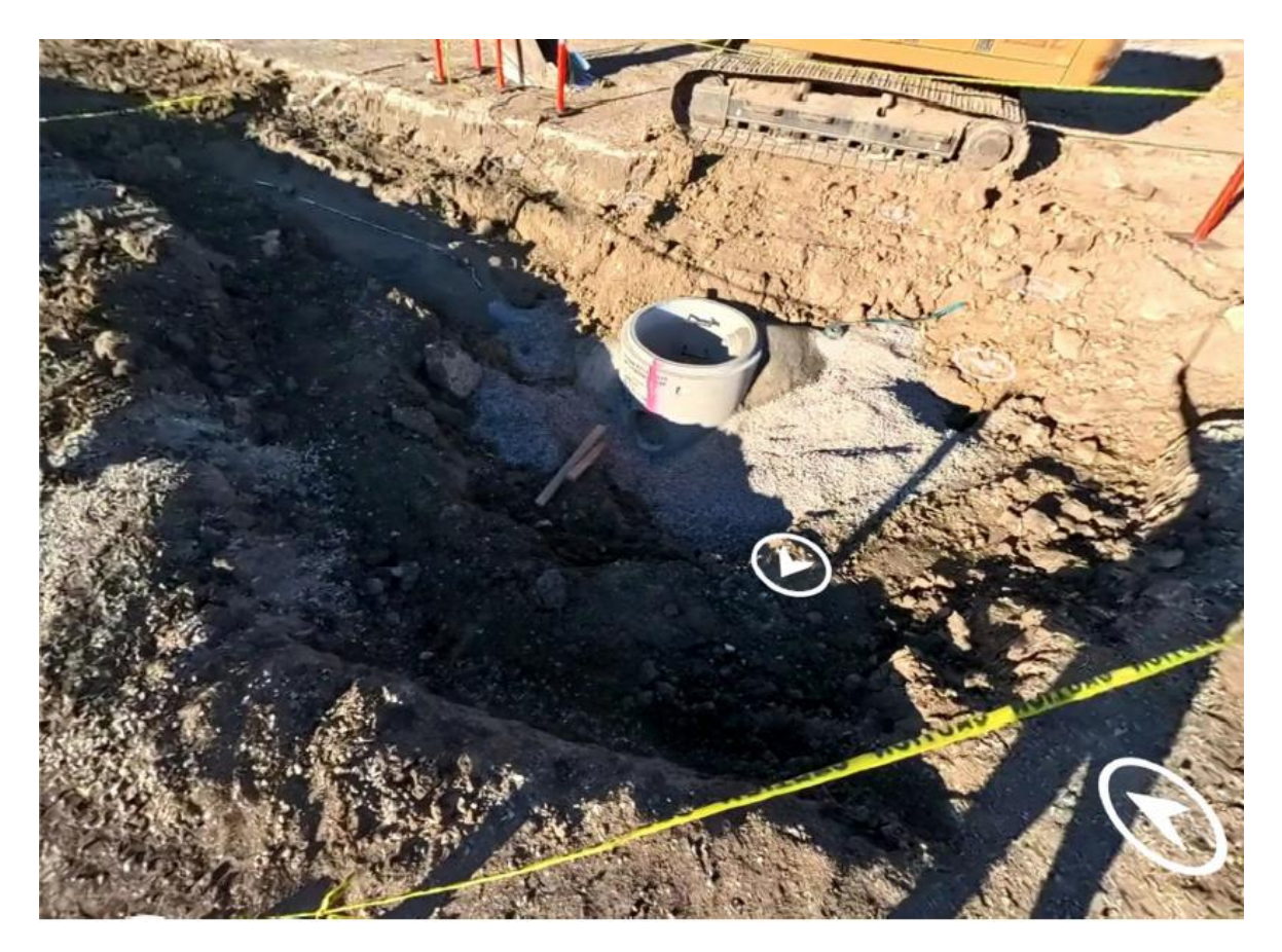
Figure 7: One of Various Storm Structures Installed